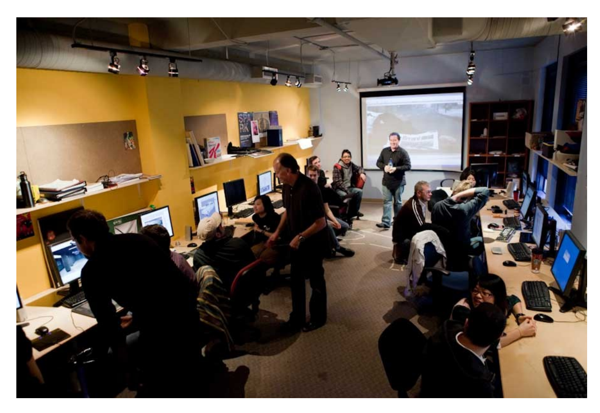
"Attack of the VFX Gods," school tour of VanArts by SPARK Festival Speakers.

A wide shot of the speakers and VFX 10 students in the classroom.